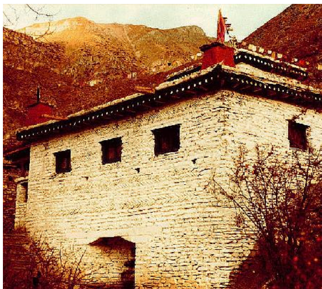
The "Temple Of Miraculous Fire" at Muktinath, Nepal. Photo by Ken Street (Nov. 1979).

[For more on this subject, please read our tract The Temple Of Miraculous Fire .]